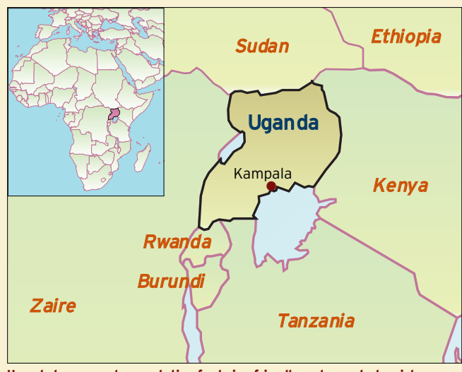
Uganda has earned a reputation for being friendly and open to tourists.

Visit historical and cultural sites and meet local officials. Day 3: Travel to Fort Portal. Visit development projects, schools and farms. Day 4-5: Cycle to Kibale National Park; forest hike and observe a variety of primates. Day 6-8: Cycle along the Rift Valley escarpment, including Queen Elizabeth National Park. Day 9-